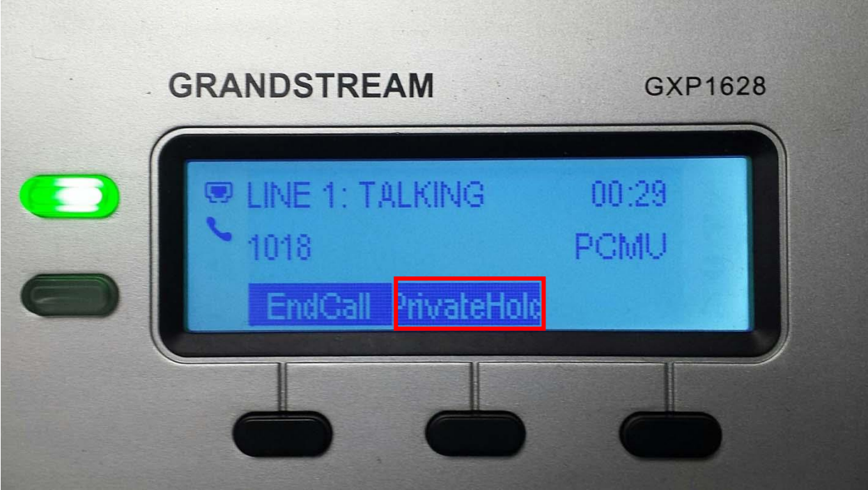
Figure 7: Put a Call on Hold